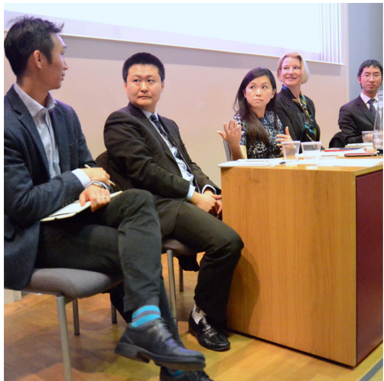
Below: Panel session on the economic and financial landscape of China